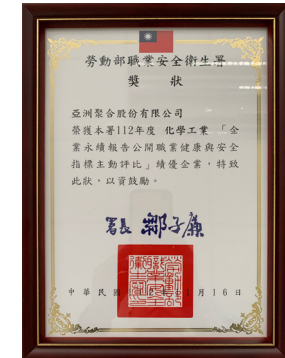
Top 10% enterprise in the “Proactive Evaluation of Occupational Health and Safety Indicators in Corporate Sustainability Reports” by the Occupational Health and Safety Administration in 2023