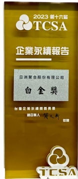
“Platinum Award - Sustainability Report Categories” of Corporate Sustainability Report Awards at the 16th Taiwan Corporate Sustainability Awards (TCSA) in 2023