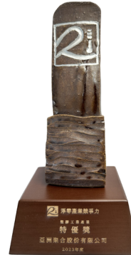
“Net-Zero Industry competitiveness” - Distinguished Honor Award in 2023