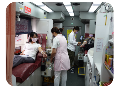
The 9th “Neihu Technology Park 1,000-People Blood Drive” in 2023