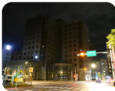
2023 “Earth Hour”, a global voluntary energy-saving and carbon reduction activity