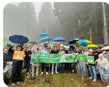
2023 “Add a Touch of Color to the Earth, USI Group Plants a Field of Green” afforestation activity