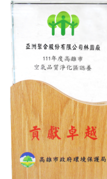
“Air Quality Purification Zone Adoption Program” in Wang Gung Elementary School at Kaohsiung City in 2023